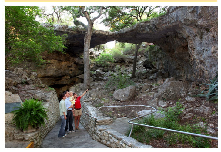
The entrance to Natural Bridge Caverns Discovery Tour and the name sake "Natural Bridge."

The explorers made their way carefully climbing and crawling through two miles of vast cavern passage. After making this amazing discovery, they returned to the surface to tell the landowners. The discoverers knew immediately what an astonishing find they had made and the land owners decided to develop the first 1/2 mile, the most spectacular part of the caverns, for the enjoyment of guests from around the world. That first 1/2 mile is now the Discovery Tour. Natural Bridge Caverns Discovery Tour was developed with two main goals in mind: preservation of the caverns' environment and comfort of its guests. The result is one of the world premier show caverns, and one of the most popular attractions in Texas.